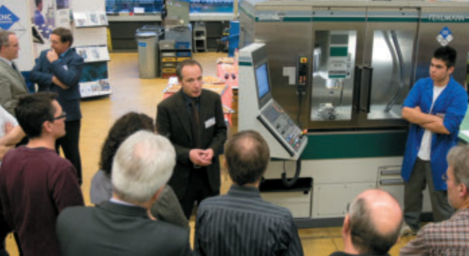
Heidenhain-Swissmem-Fehlmann CNC project, CNC Competence Centre